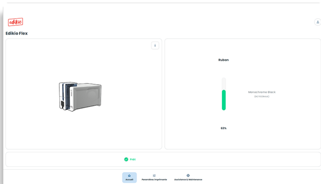
Edikio Premium Suite 2 Interface

Now fully digital, the Edikio Guest software—included in the Edikio Guest Access and Flex printing solutions—is evolving into a brand-new version. The interface has been redesigned to enhance the user experience, with the main new feature being a new print driver.